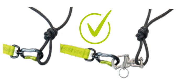
*The quick release (Panic Snap) offers an additional possibility to separate the leash from the belt even under tension in dangerous situations.

Now attach the carabiner of the leash to the loop provided or to the Panic Snap, which is available separately. (NOTE: We recommend the additional use of a quick release (Panic Snap*) between the loop of the upper belt & the carabiner of the leash. Attach the other end of the leash to the dog's harness. (NOTE: The belt system may only be used in combination with a dog harness - Not suitable for use in combination with collars!)